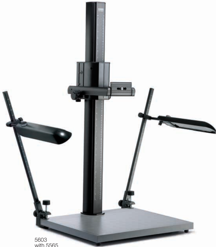
5603 with 5565