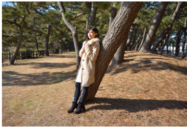
Focal Length: 35mm Exposure: F/4 1/640sec ISO: 100