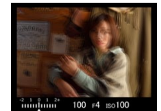
Simulated viewfinder image.