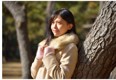
Focal Length: 150mm Exposure: F/4 1/640sec ISO: 100

For the first time, a dedicated portrait lens that allows you to zoom through various composition options as creative ideas zoom through your head. The 35-150mm F/2.8-4 Di VC OSD (Model A043) zoom lens is based on the new concept of allowing you to concentrate on a wide range of portrait compositions without the interruption of pausing to change lenses. There are so many options. Set the focal length in the 85mm that is ideal for head and shoulder portraiture, or zoom out to 35mm at the wide end, or zoom in to 150mm at the telephoto end. From full body shots to a close-up of facial expressions, you can capture the subject without changing your position or disturbing your flow. Adding to the efficiency of this lens, scale marks on the lens barrel indicate common focal length settings for portrait shooting. The fast F-stop offers F/2.8 at the wide end while maintaining a bright F/4 at the telephoto end. In addition, the Model A043 provides an MOD (Minimum Object Distance) of 0.45m (17.7 in) across the entire zoom range allowing you to approach the subject close-up, which adds new possibilities to portrait composition. This marks the birth of a portrait zoom lens that lets you enjoy shooting subjects with greater freedom and endless possibilities. High quality, flexibility and broad creative expression—you can have them all with Tamron's new portrait zoom lens.