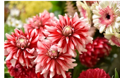
Focal Length: 85mm Exposure: F/3.5 1/60sec ISO: 100