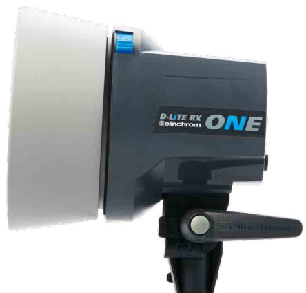
D-Lite RX ONE — 100 Ws — N° 20485.1