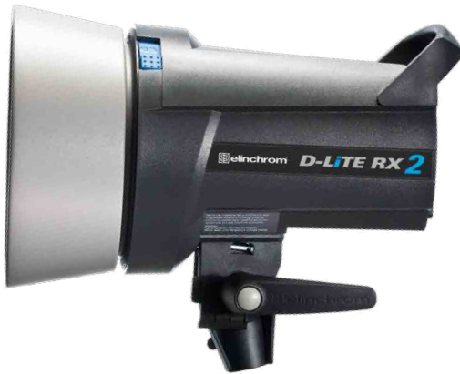
D-Lite RX 2 — 200 Ws — N° 20486.1