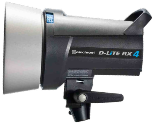
D-Lite RX 4 — 400 Ws — N° 20487.1